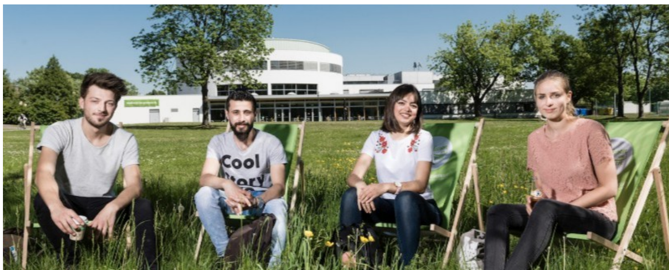
Studying in green places