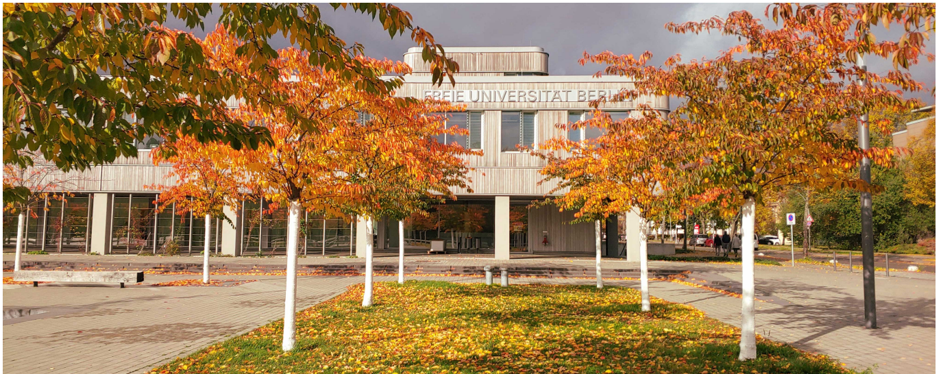
"Holzlaube" of Freie Universität Berlin in autumn 2020