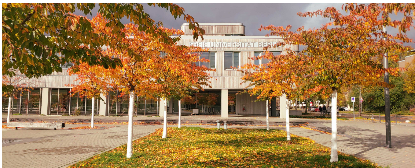
"Holzlaube" of Freie Universität Berlin in the autumn of 2020