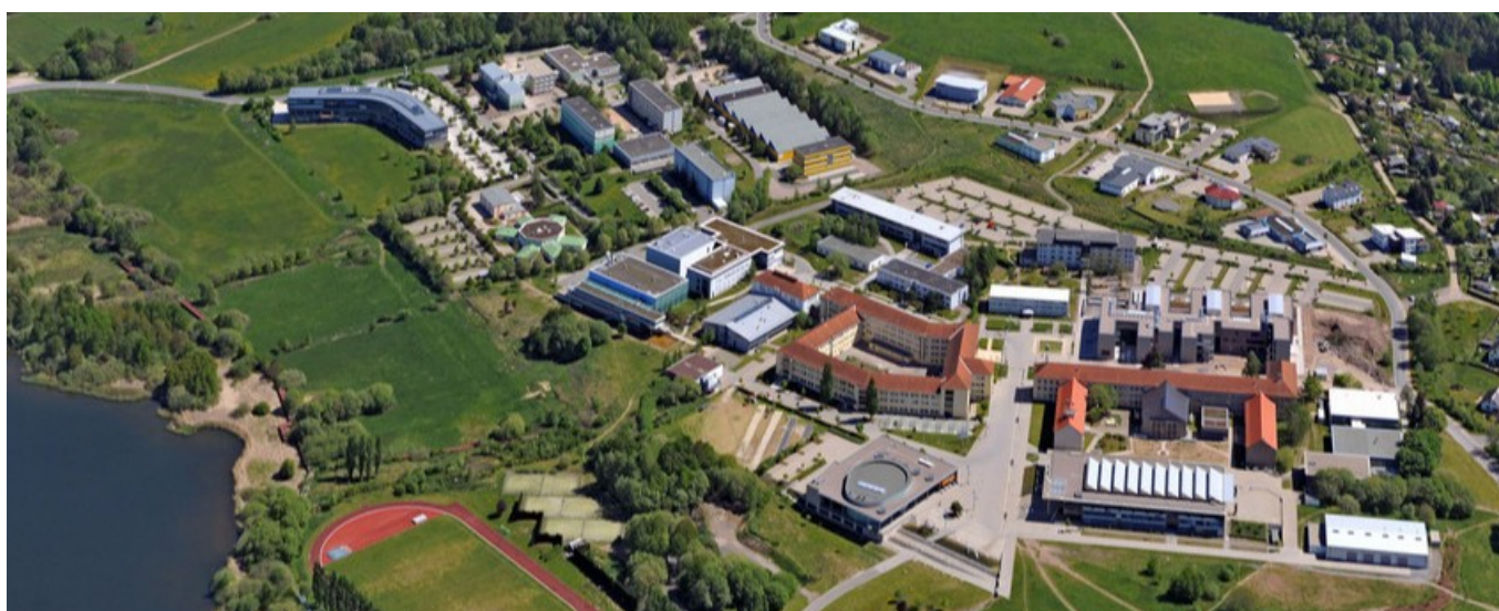
Campus of the Technische Universität Ilmenau