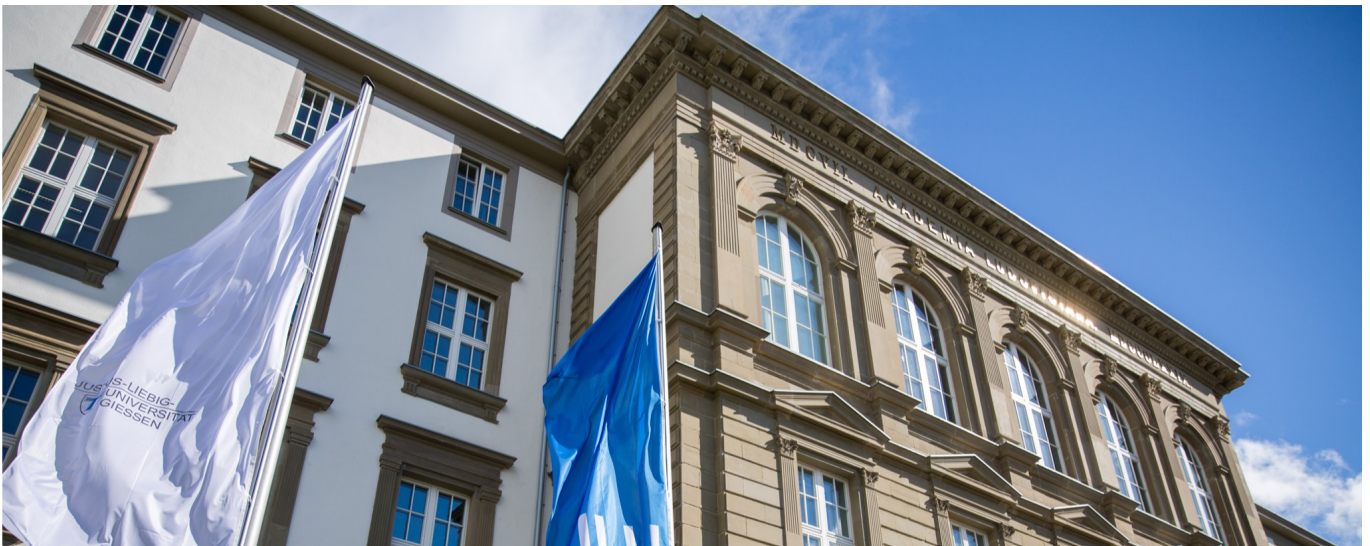
The main building of JLU