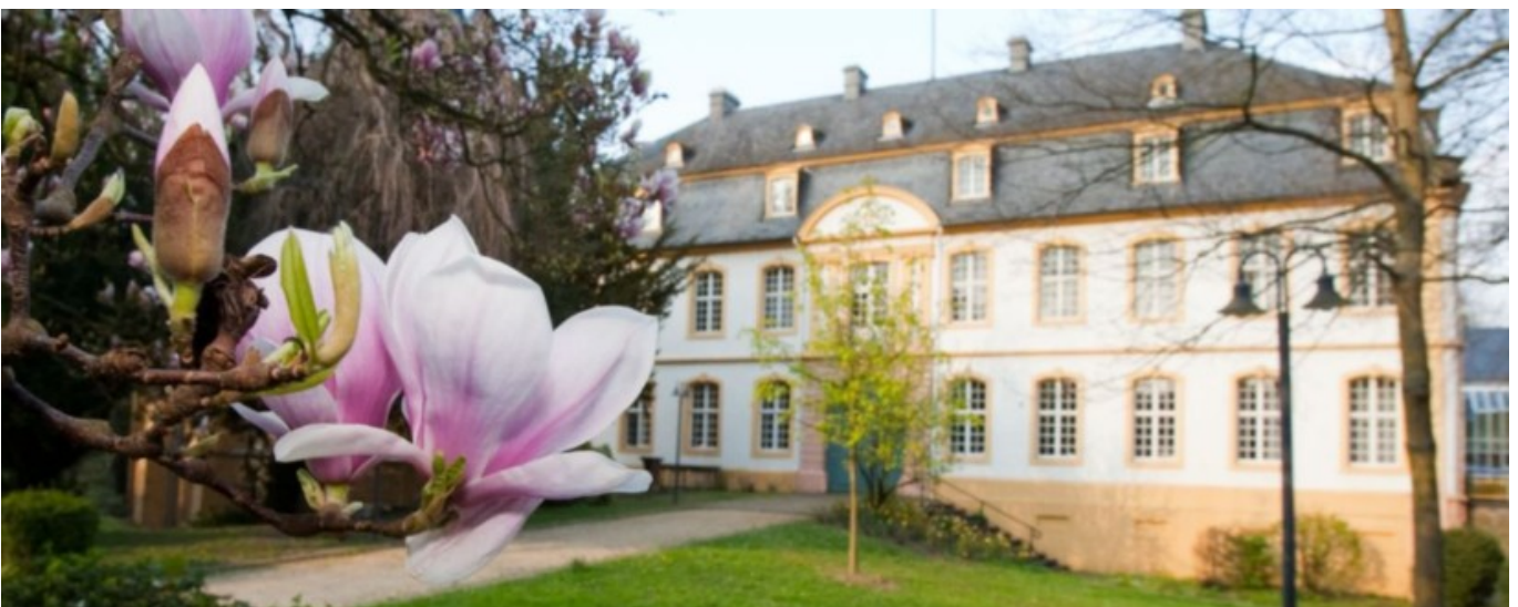
Vallendar campus – Marienburg building