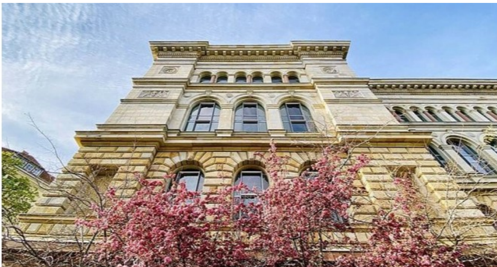
TU Berlin Main Building

Join us for the TU Berlin Summer & Winter School!