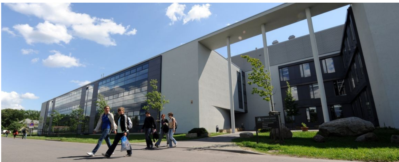
Institute of Geosciences, University of Potsdam