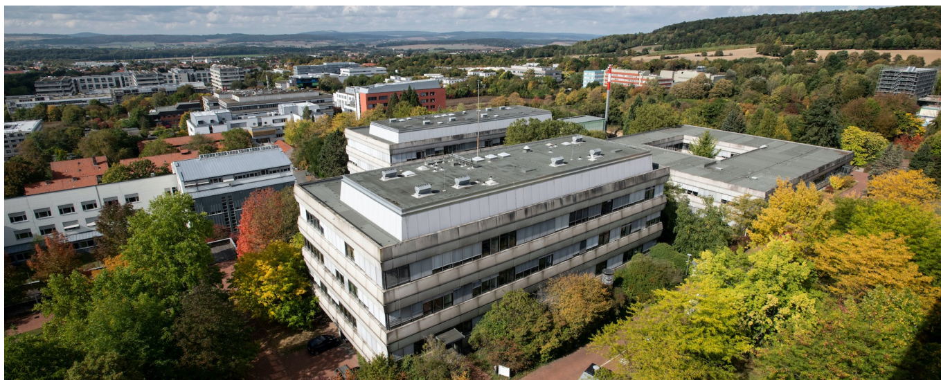
Forest Faculty on the North campus of the University of Göttingen

© Faculty of Forest Sciences and Forest Ecology