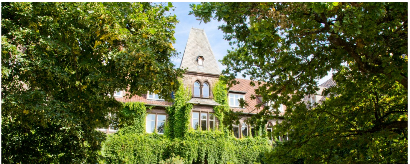
Kassel University, Campus Witzenhausen