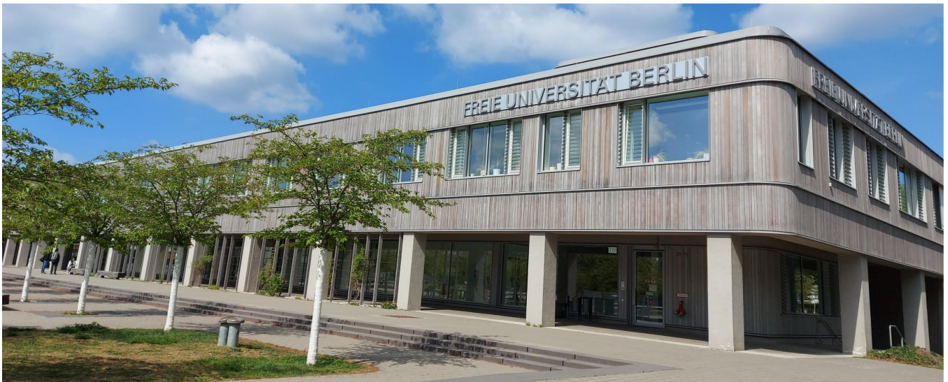
"Holzlaube" at Freie Universität Berlin