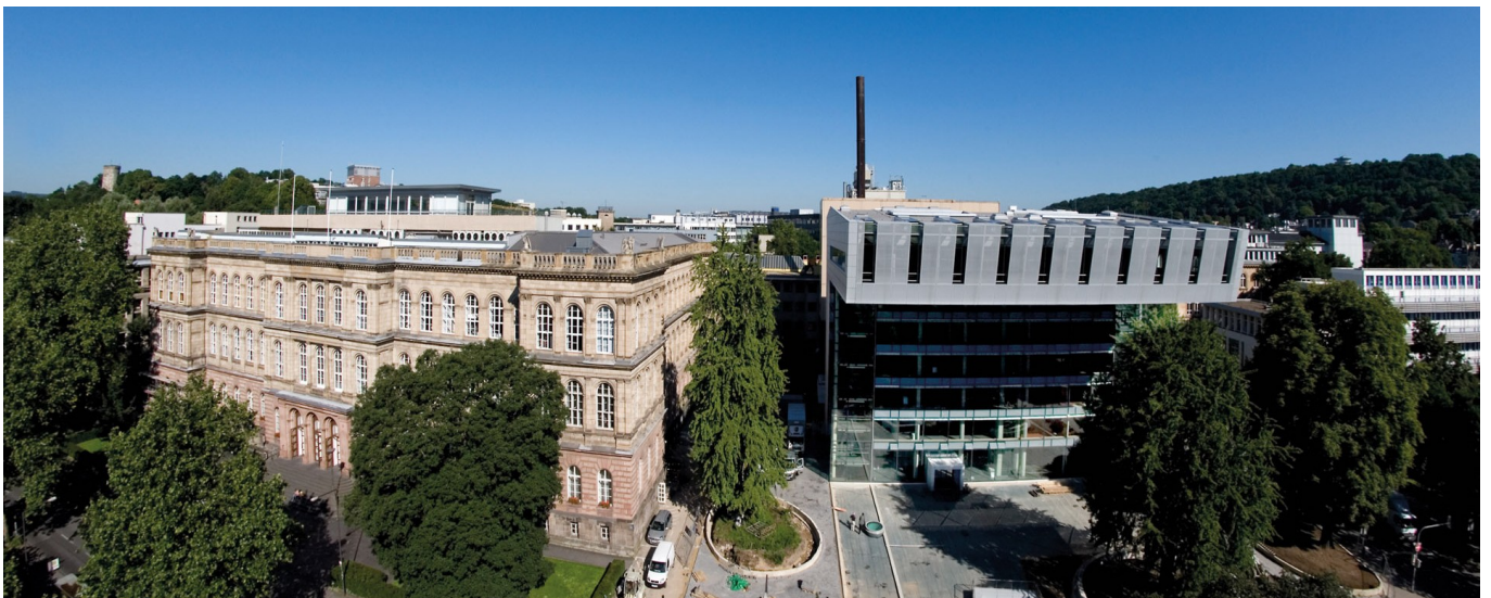
RWTH Aachen University