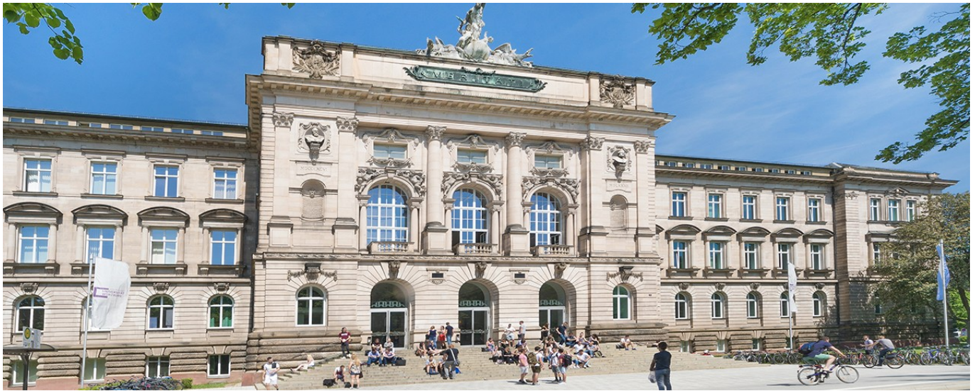
New University of Würzburg