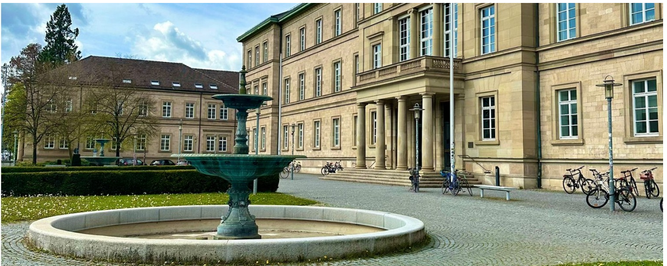
Main lecture hall at the University of Tübingen

Innovative. Interdisciplinary. International. Since 1477.