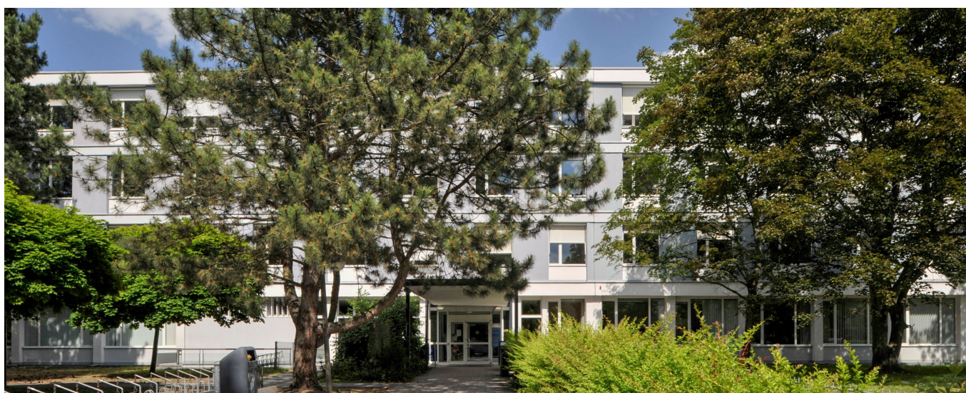
Institute for East European Studies at Freie Universität Berlin