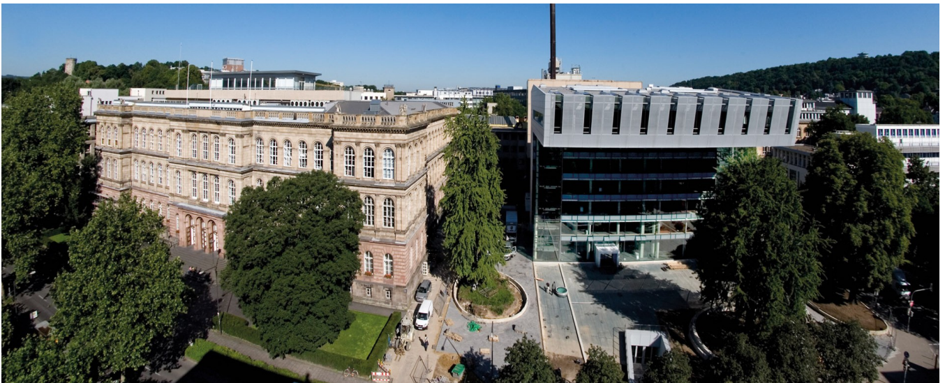
RWTH Aachen University