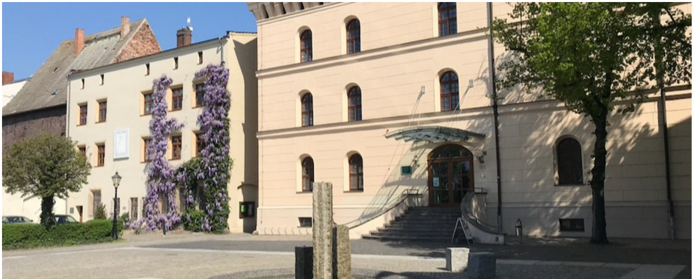
Stiftung Leucorea – Institut für deutsche Sprache und Kultur e. V.