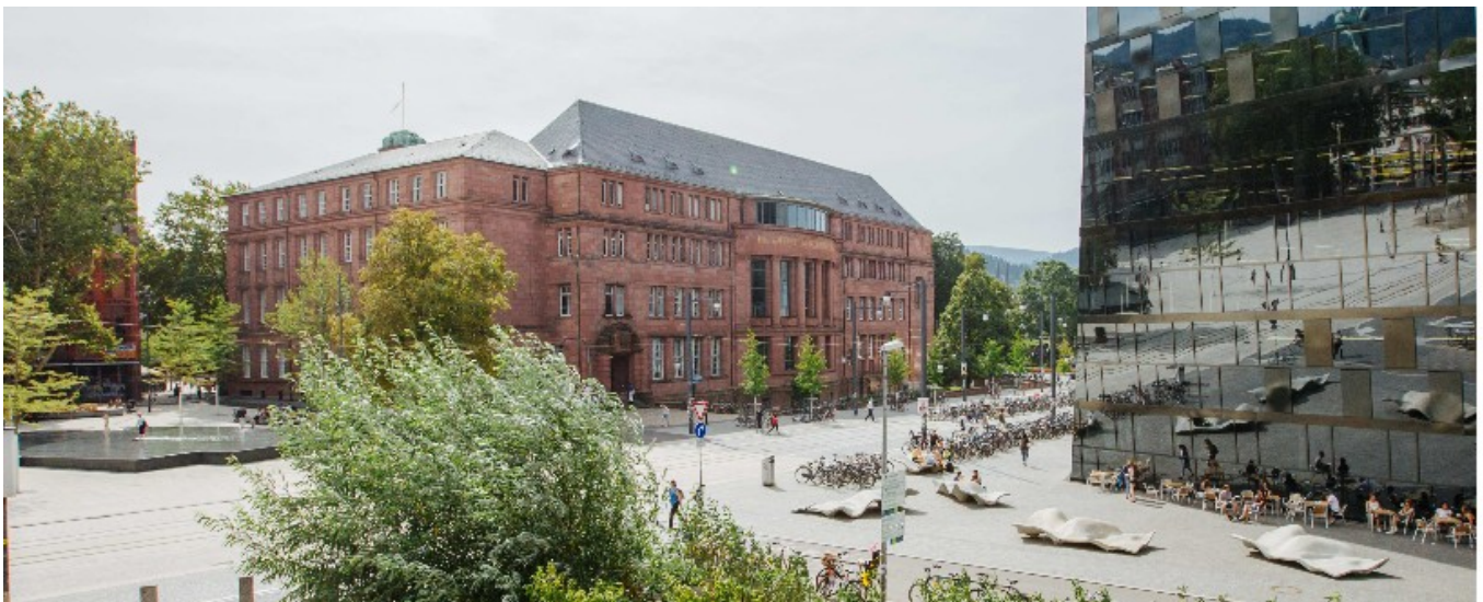
University of Freiburg