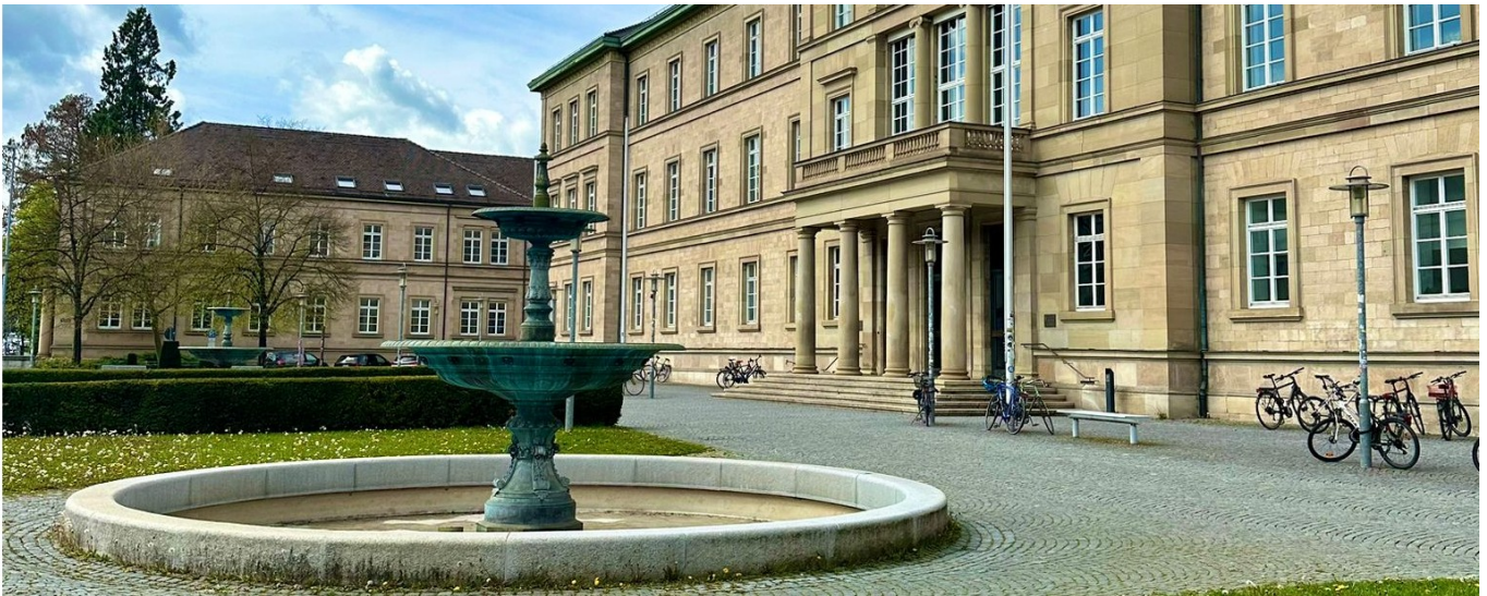
Main lecture hall at the University of Tübingen